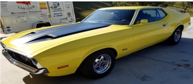
351 Cleveland motor, Automatic transmission

For Sale - 1971 Ford Mustang Call Guy @ (423) 258-2255